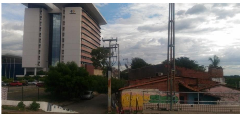
Figure 1: The difference between Cameron tower and the Gaviões community.