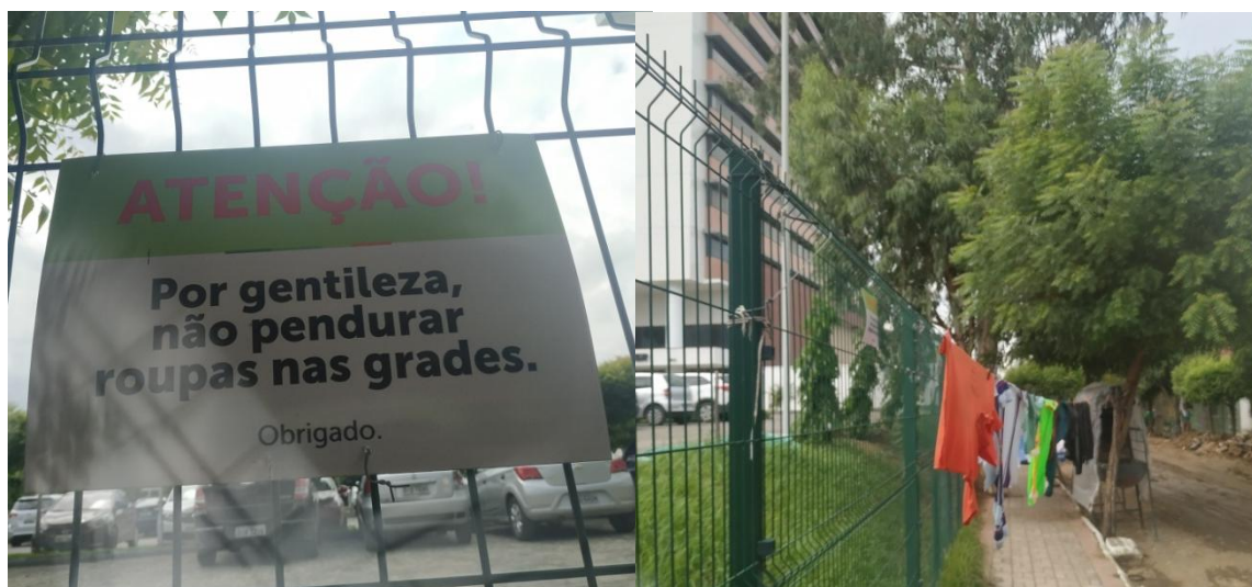
Figures 2 and 3: Sign placed in the fences of Sobral shopping mall and Cameron tower.

When entering Dom Expedito, it is possible to identify the difference in the landscape. From far, one can see clothes hanging near the parking lot of the mall and the tower, side by side with a sign that says, "Attention! Please, do not hang clothes on the fence." (Figures 2 and 3).