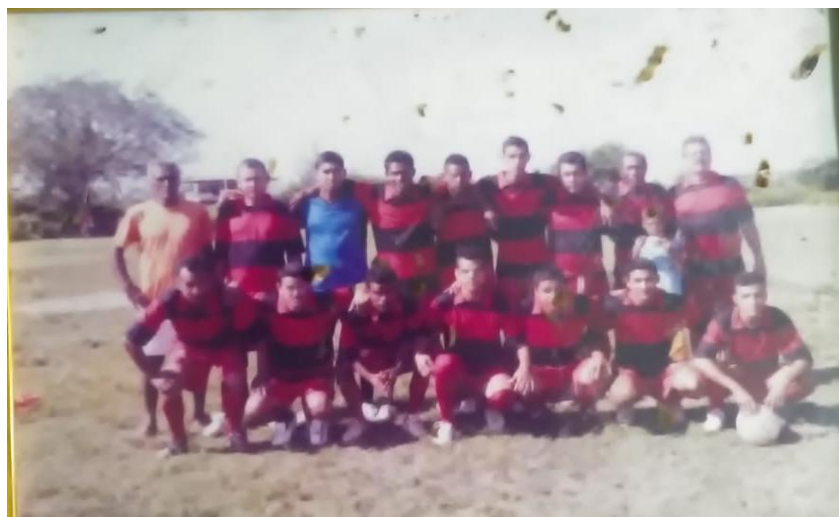
Figure 6: Previous soccer field of the Gaviões team.