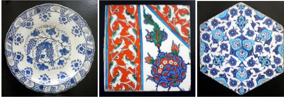
Picture13-14-15: Examples of Iznik tiles

“The figures specific to China ceramics frequently found in middle east were seen to be used in Iznik circa 1400” (KÜÇÜKYILMAZLAR, A, 2006, p;8).