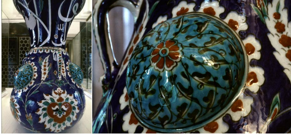
Figure22-23: TileKandilandDetail View

It is possible to see, the coral red color, which is the most significant characteristic of the 16 th century, on some of the chinaware oil lamps. Herbal motifs, and kufi and sulus writings in calligraphic Arabic script were very skillfully embroidered on chinaware oil lamps. In the chinaware oil lamps of the late the 16 th century, cobalt blue dominated the form, and writings and motifs were left in white color. The patterns on the chinaware oil lamps produced for religious spaces such as mosques and mausoleums are generally comprised of kufi and sulus writings. Chinaware oil lamps are comprised of chimney, collar, hanger, stem and base. Chimney is in the same width with stem in order to provide illumination. Collar is generally narrow and stem is wide. Chinaware oil lamps were hanged on the ceiling or a higher place in order to illuminate the spaces. They were hanged down by means of chains (three or four) attached to their handles which were on their stems. The chinaware oil lamps that did not have a handle were hanged by placing them from their collars or bases on a metal container.