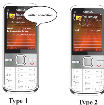
Figure 1. Different types of representation

Examples of two different representation types, for the word 'repair' are shown in figure 1 below: