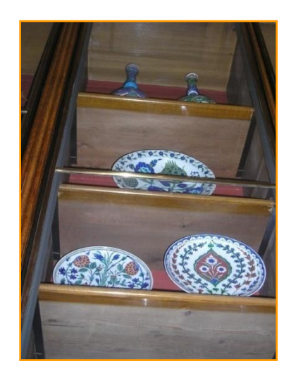
Figure 1: Enlightenment Room Case 23