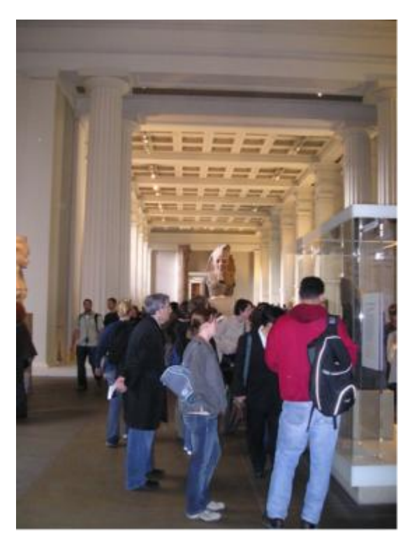
3 "Enlightenment " space