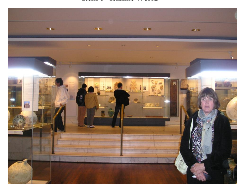
Item 7 Grenville [Gifts shop]