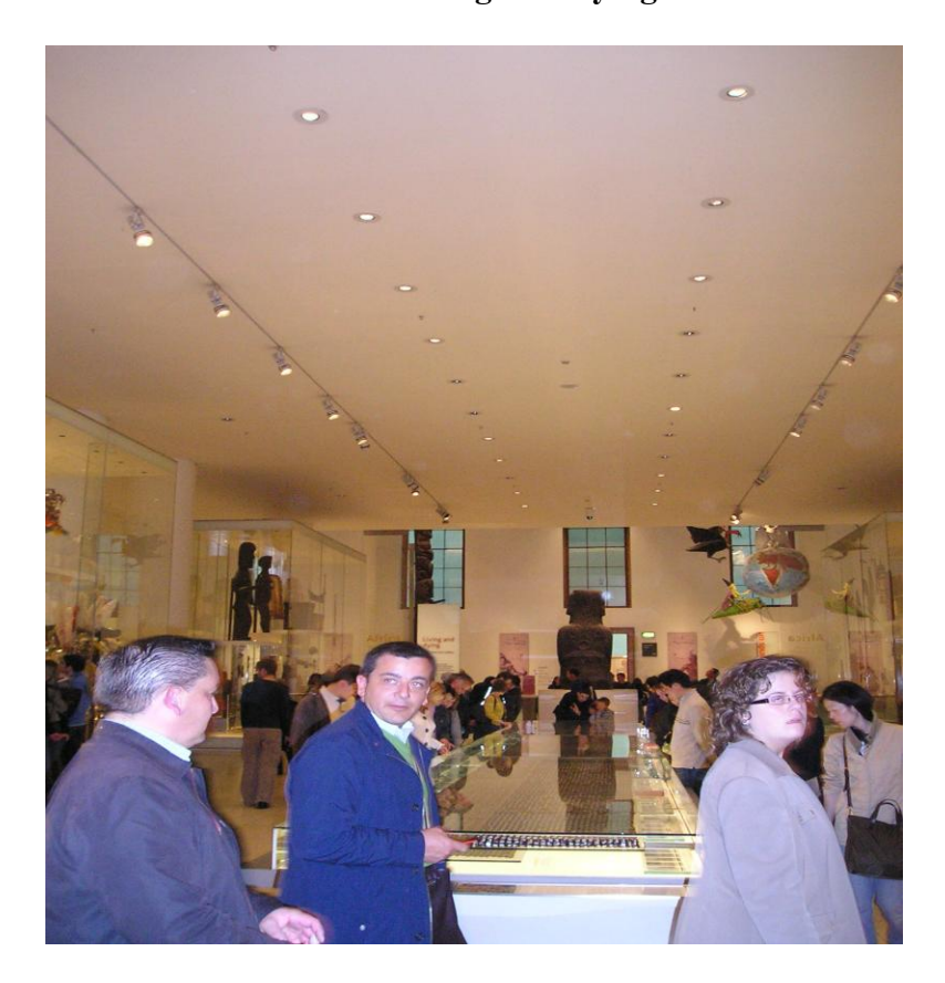
Item 5 From "Living and Dying" to a downward path that leads to "Islamic World" up to the Buddha.