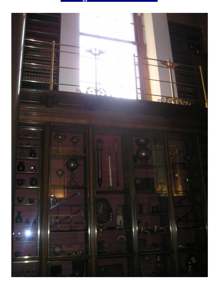
Inside "Islamic World". The "Islamic Science" display.