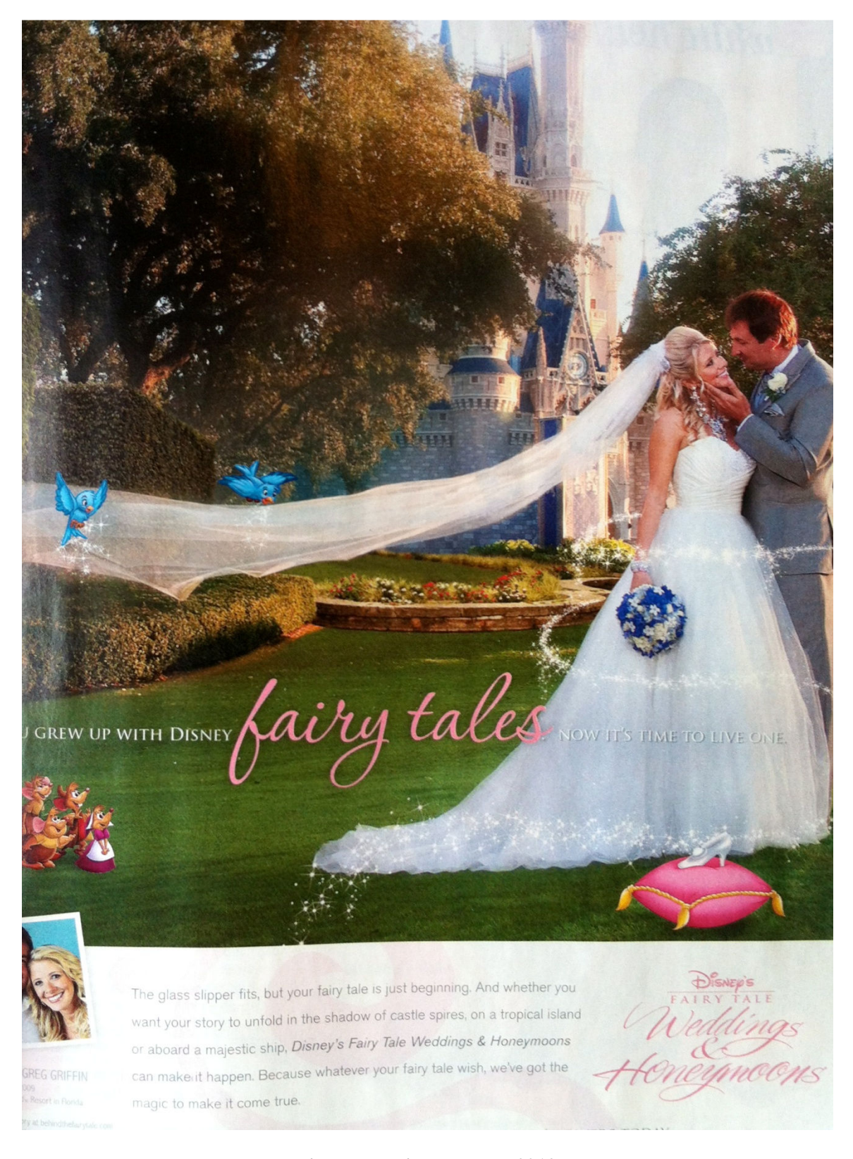
Figure 5: Brides, March 2012