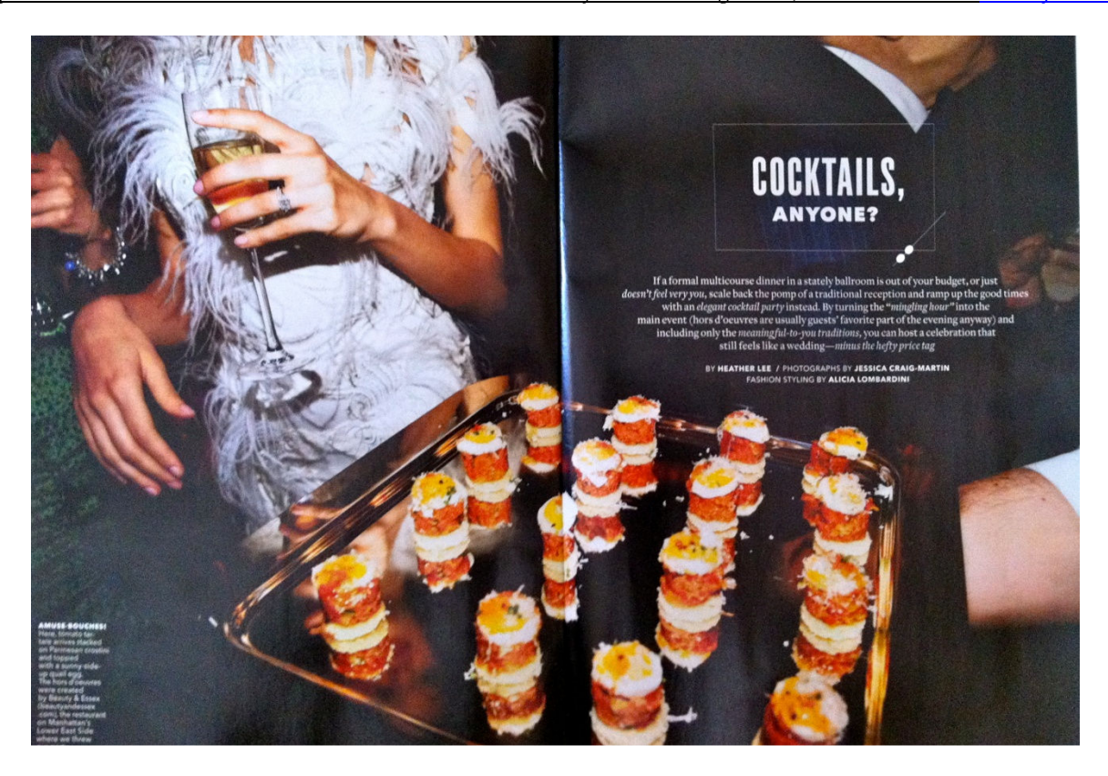
Figure 6: Brides, May 2012