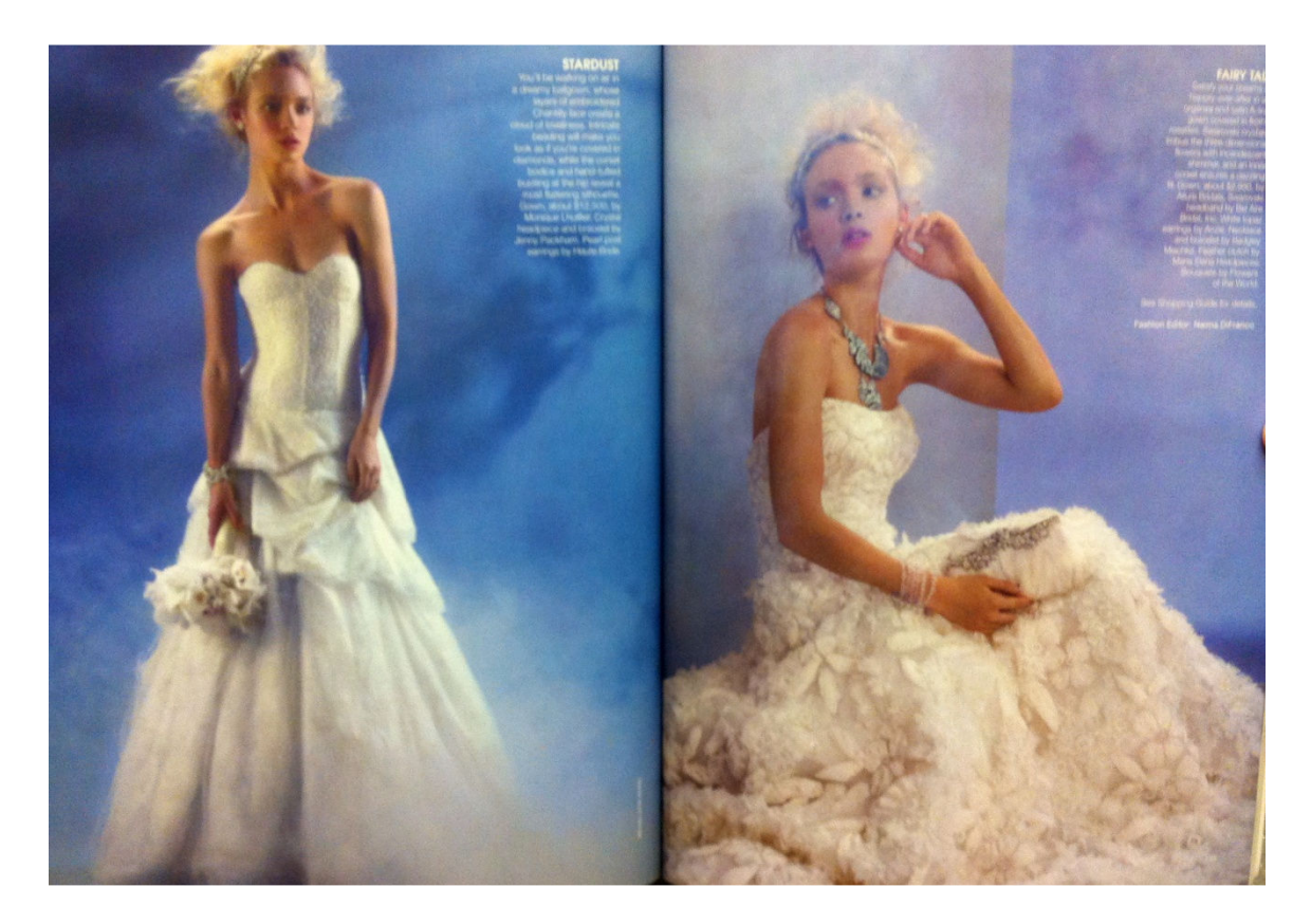
Figure 4: Bridal Guide, November/December 2010