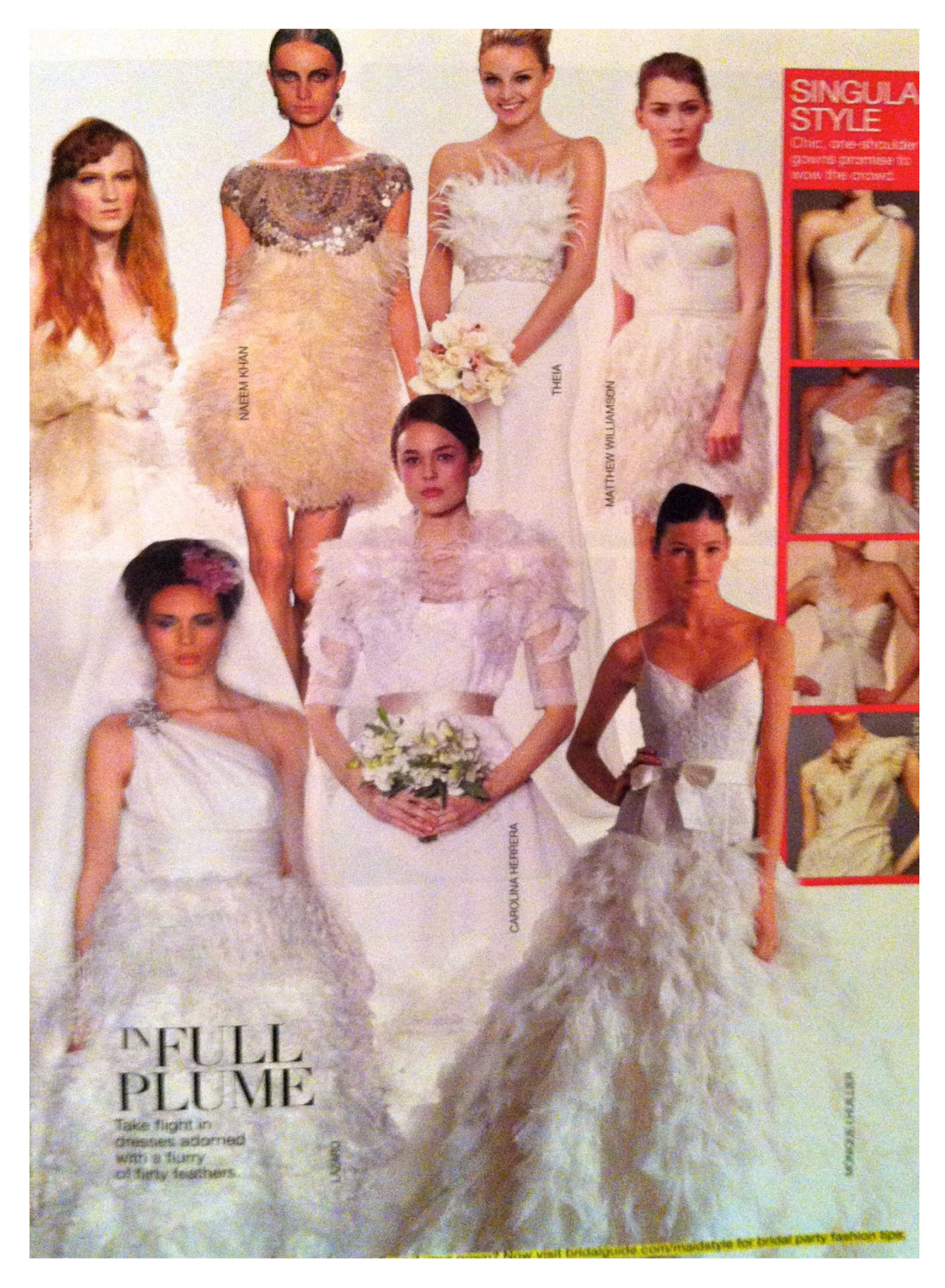
Figure 7: Bridal Guide, November/December 2011