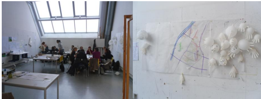
Fig. nº 3, ”Groups working in the presentations”

In this first level, the team make several meetings and do presentations of feelings and emotions, about the place. All groups do the same and discussed the different point-of-views and paradigms. They just can talk or do performances (Fig. nº 3). Starts the discussion time!