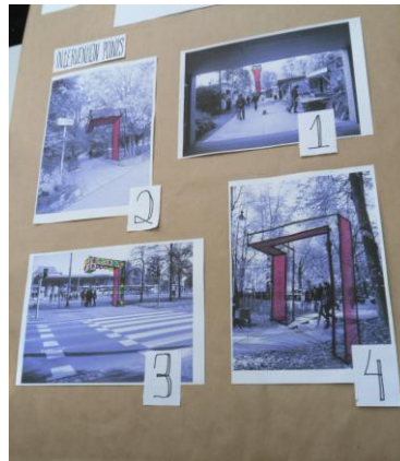
Fig. n° 5, " Convert undervalued city elements into living pieces, applying on the interior side of the modules, panels with interactive and useful information. The public himself can actually update the information."