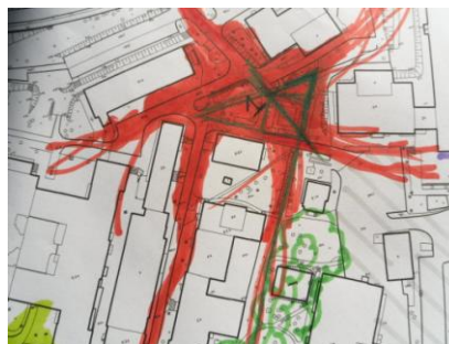
Fig. 1 “Plan of the intervention area”

We cannot talk about visual perception without speaking of the drawing. What is the drawing? The design is a fundamental instrument in the functional and planning methodology in architecture, in the Visual Arts and design, "the design is probably the form of expression that best sums up our relationship with the world. It enables us, with the mental preparation, developing ideas and discovery of what still we do ourselves. "[4] All groups, individually, went to outside do interpret the space and the intervention area. According them felling’s, they started doing some sketches, over the plan, to understand the most important areas for the project. To do that, they talk and make some marks with colours.(Fig. nº 1) They started to understand the meaning of the streets and walkways.