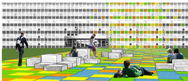
Fig. nº 4, ” Pixel stream made of pixels of water, grass and light panel that would light when you step on it... or if already be shining - that would escape from you giving students invitation to follow it.”

The final work it was presented in the Mini Symposium with the results of the international workshop. The groups could made presentation using video, power-point, models, performances, and portfolio panels. They transform the space; they make the place user friendly. As an example we can see in (Fig. nº 4 and Fig.5) the proposal of the 2 nd group, the transformation in front of one of the buildings, near the university, and applying sculptural objects, originated by a need to guide people into campus direction.