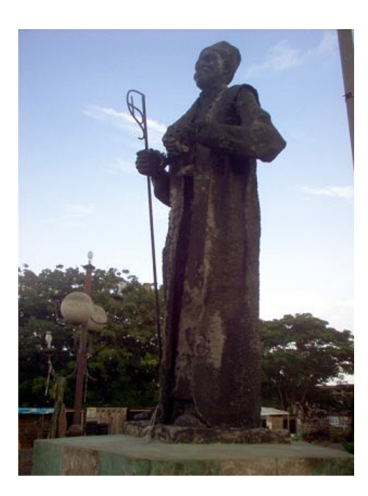
Plate 6 Obiora Madu, Bishop Akinyele , cement, height: 264cm, Molete, Ibadan. Photograph by Akintonde Moses, 2004