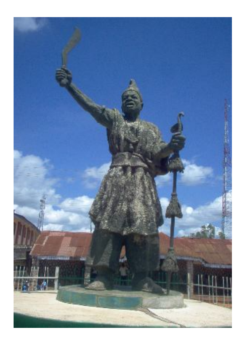
Plate 4 Akintonde Moses, Ajagunnla , cement, height: 270cm, 1987, Ila-Orangun. Photograph by Akintonde Moses, 2007