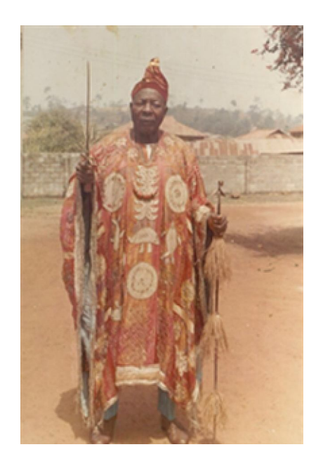
Plate 2 Segede regalia, with the gracious permission of Oba Williams Ayeni, Ariwajoye 1<sup>st</sup>, The Orangun of Ila, displayed in preparation for the making of Ajagunnla statue.