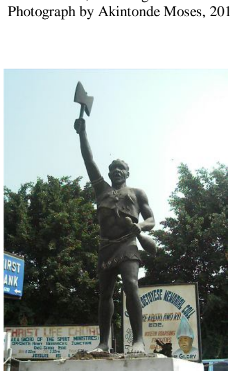
Plate 5 Akah Bunak, Sango-Timi , cement, height: 300cm, Okegada, Ede. Photograph by Akintonde Moses, 2004