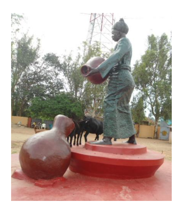
Plate 3 Akintonde Moses, Iyala , fundu, 2004, Ila Orangun Palace. Photograph by Akintonde Moses, 2013