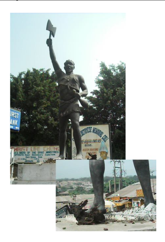
Plate 7 Remains of ritual animal on the pedestal of Sango-Timi