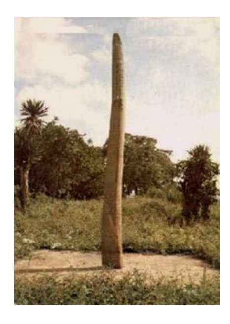
Plate 1 Opa Oranmiyan (Oranmiyan staff), Ile-Ife

Wikipedia, the free Encyclopaedia (2013). "Ila-Orangun". Retrieved from from http://en.wikipedia.org/wiki/Ila-Orangun (June 3, 2013).