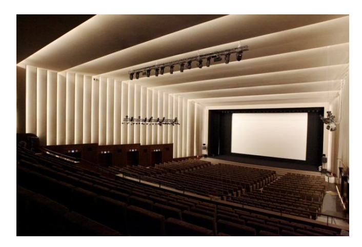
Figure 1. Main screen at the Sala Grande with 1,032 seats

Depending on whether the film is a new production or a restored film the screening will take place in a specific venue. This fact affects the viewer experience since it is not the same to sit at the Sala Grande (see image 1) or Pale Biennale (see image 2), with 1,032 and 1,700 seats, respectively, than the Sala Passinetti or Sala Volpi (see image 3), both with 150 seats. Within this context, films competing at the official sections Venezia 69 , Out of Competition and Orizzonti are mainly screened at the Sala Grande and Pale Biennale, while restored films from the Retrospective 80! and Vennezia Classici are mainly screened at the Sala Passinetti and Sala Volpi.