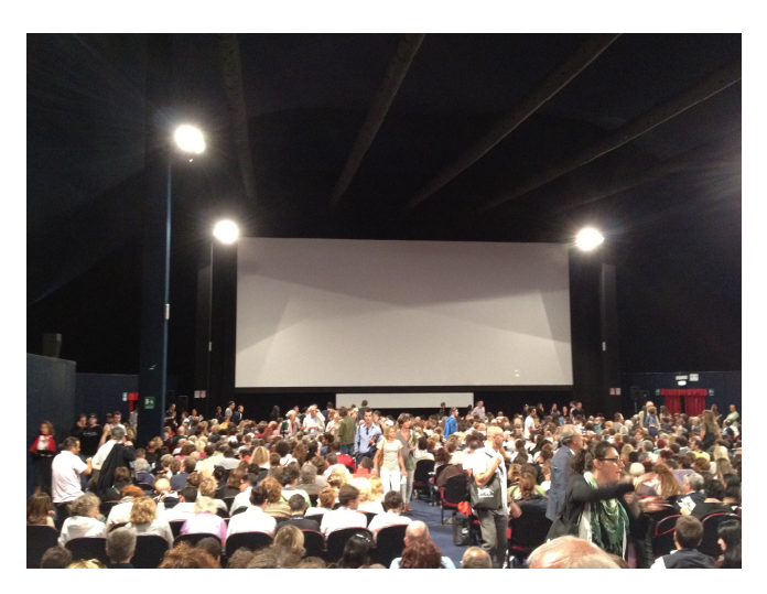
Figure 2. Main screen and screen with subtitles at the Pale Biennale 1,700 seats