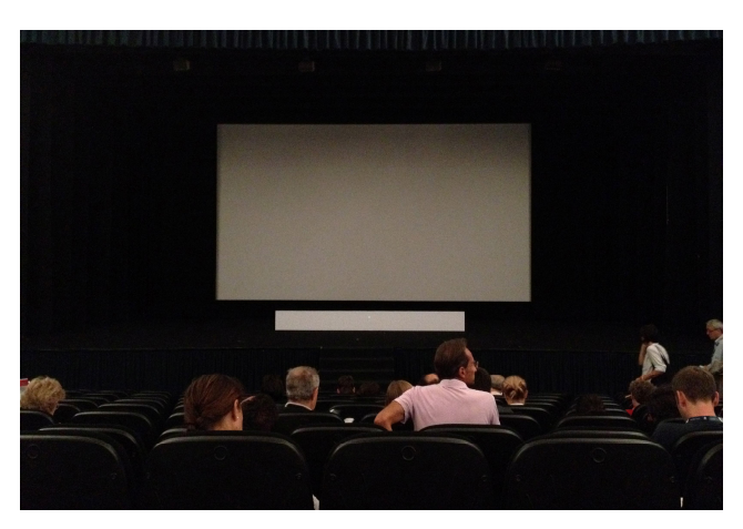
Figure 3. Sala Volpi with 150 seats

Moreover, the Venice Film Festival has adapted to new technologies and has included a new venue and viewing format, the Sala Web, where the films are streamed. The user can connect to the purposely-designed Internet platform, which allows film viewing in streaming of 10 feature-length films and 13 short films from the Orizzonti section from a computer all over the world with access to Internet. The Sala Web concept has 500 virtual seats, and tickets might be purchased online, then a personal link is sent for one-off viewing in streaming on a computer within a restricted 24-hour period. Films are provided in the original version with English subtitles. From the many Festival sections and the cinema theatres it can be safely said that not only the film content, but film screening has an influence on the audience.