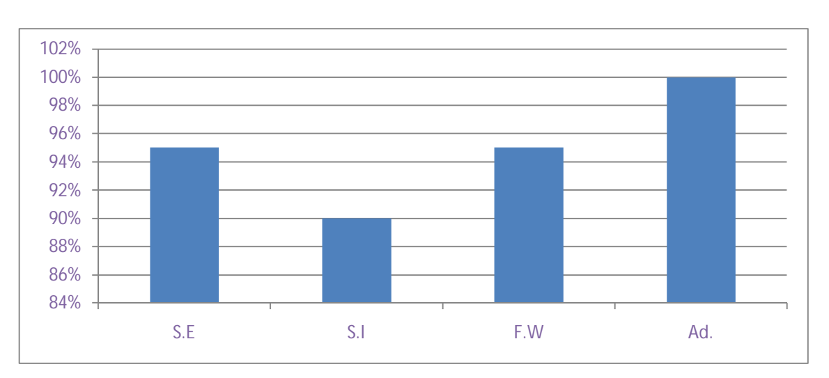
Chart. 1 Factors enhance Recruitment:

Chart 1 given above shows the responses of 239 respondents on the questions about the factors that improve the rate of recruitment of Gen. Y teachers in private education sector. 227 respondents out of 239 agreed that self expression enhance the recruitment. As for as salary and incentives are concerned 215 out of 239 respondents considered it an important factor that influences recruitment. Salary and incentives are the factors that affect recruitment. Flexibility at work place is important for performance of duties so the 227 out of 239 respondents agree with this and the administration is considered the back bone of any educational institution so the respondents 239 out of 239 agree on this point. The variables are given below according to the response of the respondents.