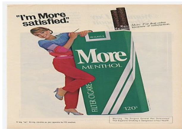
Ad 5: 'I'm More Satisfied' Advertisement for 'More' Cigarettes

Ad 5 is for 'More' cigarettes. This advertisement exemplifies a particular kind of pun which is called (puns with two communicated meanings) where the addressee needs to communicate both interpretations in order to come up with a comprehensive picture of a given advertisement. Please refer to the following image.