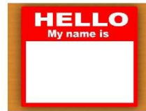
Figure 4: Grade 2 Student Art Project