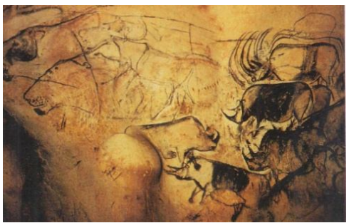
Fig.2. Left Section of the Lion Panel. Chauvet Cave, Ardeche Valley, France, c 25,000-17,000 B.C. Black pigment on limestone wall.