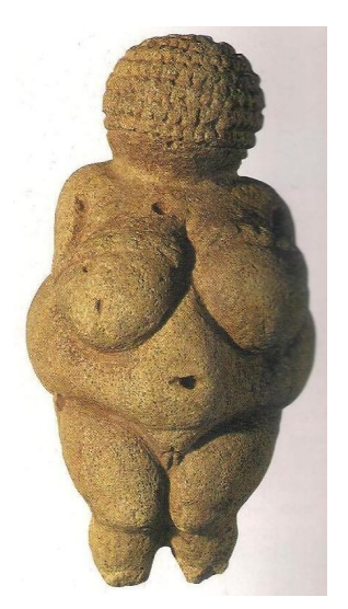
Fig.8. Venus of Willendorf, Austria, c. 25,000-21,000 B.C. Limestone (115cm) high. Naturhiswisches Museum, Vienna, courtesy of L.S. Adams in A History of Western Art, 2001.

The body seems to comprise three segments, the upper, middle and lower parts. The structure of the pot is not new, as far as the 4<sup>th</sup> century B.C. in Greece, potters made similar pots of such magnitude. Sieber believes that these pottery forms in Greece were not intended to be vases, but had different shapes and functions (Sieber, 2007:11).