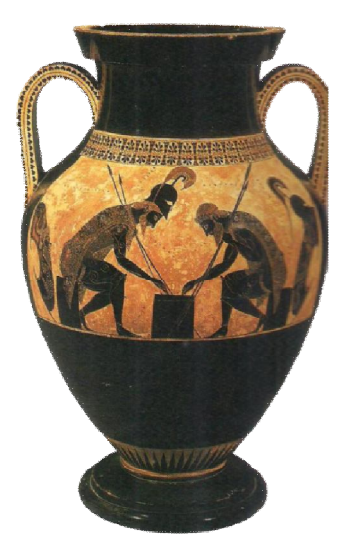
Fig.9. Achilles and Ajax playing a Board Game, 540-530 B.C Terracotta (6.1cm) high, courtesy of L.S. Adams in A History of Western Art, 2001.

The body seems to comprise three segments, the upper, middle and lower parts. The structure of the pot is not new, as far as the 4<sup>th</sup> century B.C. in Greece, potters made similar pots of such magnitude. Sieber believes that these pottery forms in Greece were not intended to be vases, but had different shapes and functions (Sieber, 2007:11).