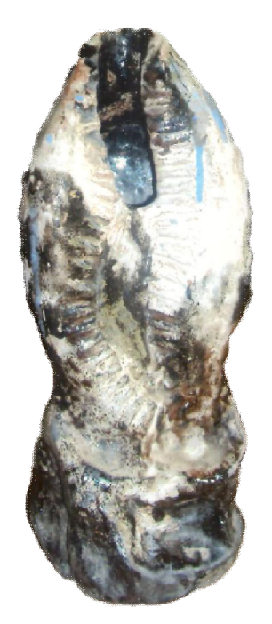
Fig.10. Ubigho (cowrie) 1994. 38x35cm, Clay and Glaze, Abraka Delta State University.