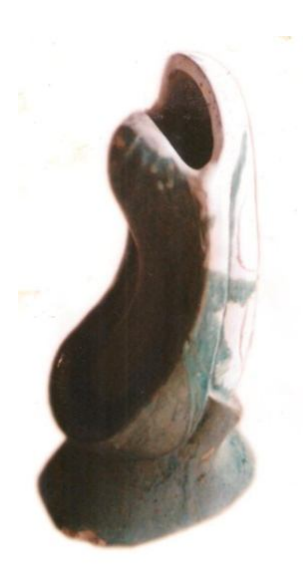
Fig. 6. The Whale, 1991. Abraka, Delta State, Nigeria (8cmx30cm) Glazed Clay

She explains that this work the whale (Fig.6) is highly creative, as she attempts to integrate environmental themes with human expressions. Look how she systematically merged zoomorphic features with anthropomorphic attributes. Thus, creating forms of unity between nature and her surroundings. Using Western glazing techniques, the choice of glaze has added colour and depth to the Whales fins. She sees the whales as a depiction of male and female relationships.