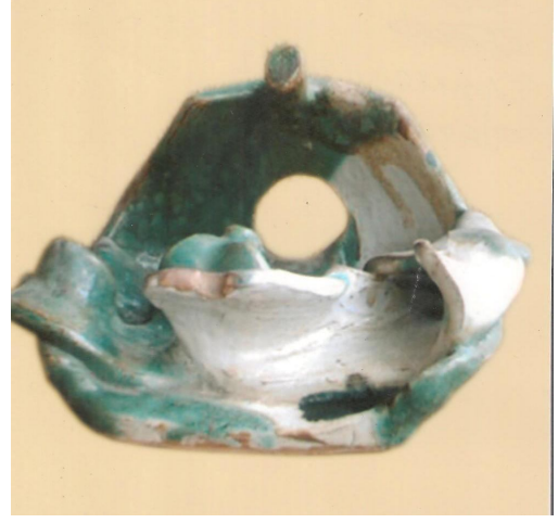
Fig.15. Oppressor (2003) Glazd clay. 15cmx 20cm