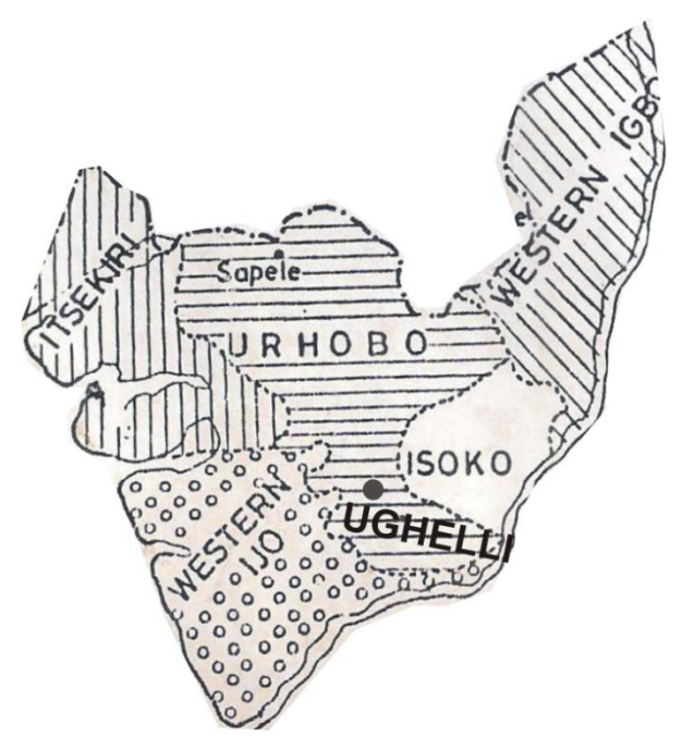
Map of Delta State Showing Ughelli South