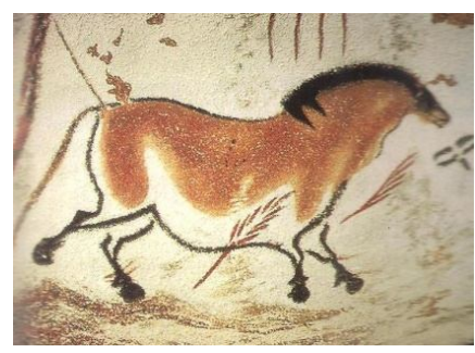
Fig. 1. Chinese Horse, Lascaux, Dordogne, France, c. 15,000-13,000 B.C. Paint on limestone rock (1.42 m) long.

The environment which comprises the natural world where people, animals and plants live has being a recurrent theme amongst artist worldwide (Oxford, 2010: 491). A good number of artist being influenced by the large repertoire of forms, derive themes from the environment. It must however be noted that, the role the environment plays is not new. For instance, the palaeolithic Western artist derived influences from their surroundings. A few examples can be seen in their cave paintings and sculptures in the round (fig 1 and 2). Even amongst the Neolithic Egyptian culture, the environment is also represented (fig3).