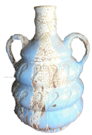
Fig. 7. Ikoro and Igben. 1993. Abraka, Delta State, Nigeria (48cmx46cm) Glazed Clay

She explains that this work the whale (Fig.6) is highly creative, as she attempts to integrate environmental themes with human expressions. Look how she systematically merged zoomorphic features with anthropomorphic attributes. Thus, creating forms of unity between nature and her surroundings. Using Western glazing techniques, the choice of glaze has added colour and depth to the Whales fins. She sees the whales as a depiction of male and female relationships.