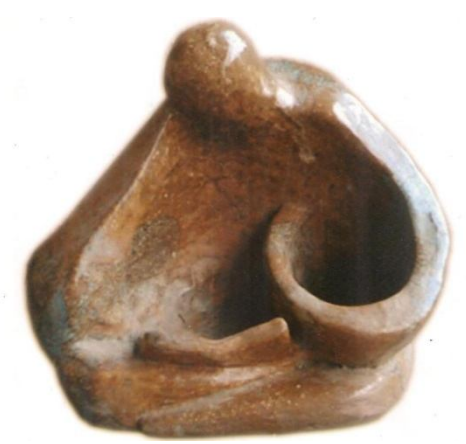
Fig. 5. Citadel of Knowledge, 1991. Abraka, Delta State, Nigeria (15cmx20cm) Glazed Clay

Between 1991 and 1992, she participated in the compulsory National Youth Service Corps (N.Y.S.C) programme, at Akwa Ibom State. There she won the best corps price of the year. That was the same year she made her citadel of knowledge in 1991(Fig.5)