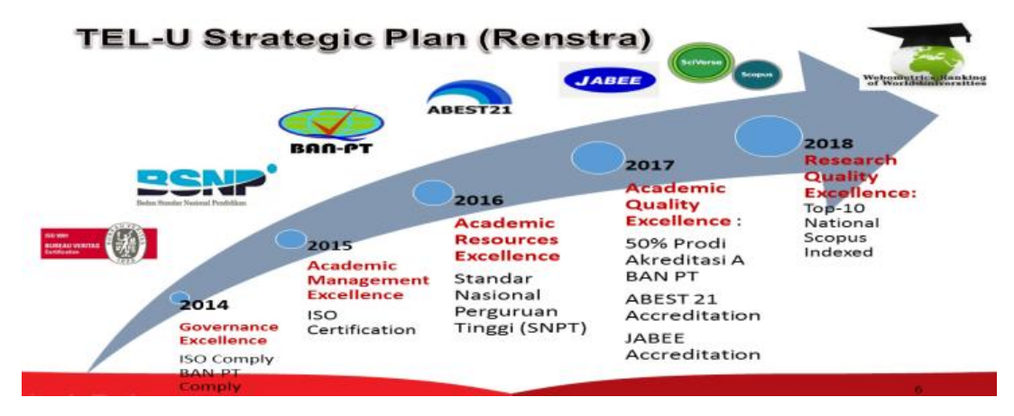
Figure 1.2 Telkom University's Strategic Plan from 2014 to 2018

This strategic plan for 2014-2018 periods has been passed. However, even though Telkom University has not made it into the World Top 1000 rankings, Telkom University has made many achievements in accordance with the strategic plan. Here are some of the achievements by Telkom University that can be seen from its official website (<a href="www.telkomuniversity.ac.id">www.telkomuniversity.ac.id</a>):