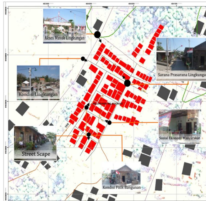
Figure 2 Benefits after Relocation