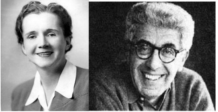
Figure 1: The Nature Writers, alarming the world

The contributions of the Nature Writers seem play a key role in the perception and representation of damage to the environment. With an international scientific reputation, they took up writing in the 1960s and 1970s to alert public opinion to environmental degradation. Rachel Carson and Barry Commoner are the emblematic figures. Their struggle is now part of the history and epistemology of the environmental movement.