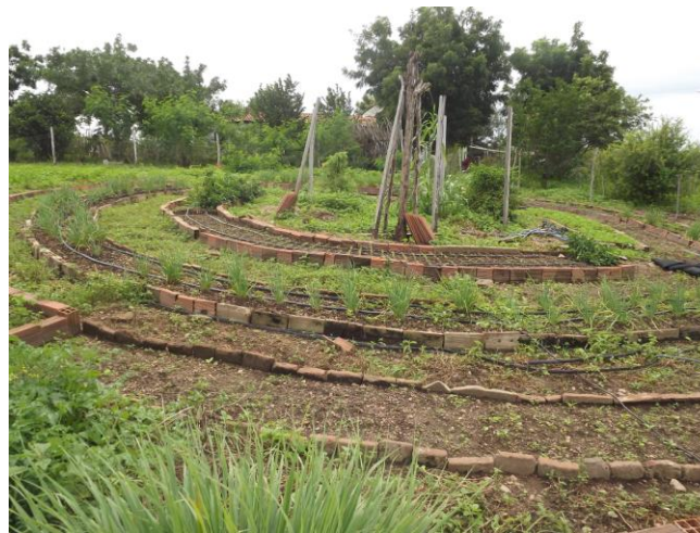
Figure 3 – PAIS Technology in Morgado

These productions are focused on both consumption and marketing in agro-ecological fairs, encouraged by the rural workers' union of Massapê. Regarding the financial issue, in times of good production, the farmer reported that his profit had reached an environment of a minimum wage per month for the products sold at the fair, but today the technology produces around 50 products due to the scarcity of rainfall in the last years.