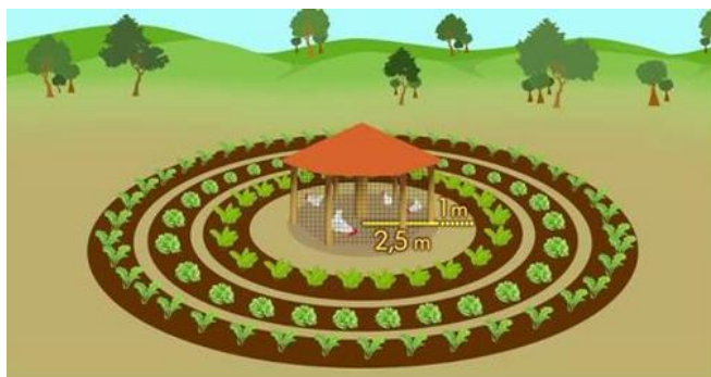
Figure – 1 PAIS TECHNOLOGY (Illustration)

For its operation, the model has the following structure: central chicken coop, followed by three circles consisting of vegetables and fruits, in addition spatial capacity for the expansion of up to 10 flower beds at the maximum. In this way, the integration of concentrated animal and vegetable production in each plot helps to take advantage of the residues derived from these activities, facilitates the nutrients transportation through the same distance from the chicken coop to the circles and the better visualization of the area by the producer. However, if the area lacks natural protection, it should be protected against strong winds that may negatively affect the plantations. For this purpose, medium-sized trees must be planted to serve as windbreaks. It is also recommended that the land used for cultivation be flat, naturally lit, a source of water close to the water tank supply allowing the irrigation operation by gravity.